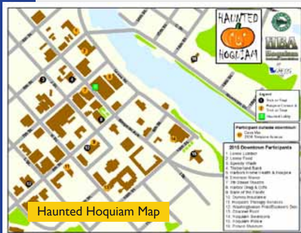
Haunted Hoquiam Map

Producing maps and maintaining local geographic data for our members is an essential service provided by GHCOG. GHCOG staff use the latest in mapping technology (GIS) and collect the most up-to-date geographic data available to create mapping products that assist members in decision making, long-range planning efforts, and hazard preparedness.