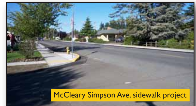
McCleary Simpson Ave. sidewalk project

GHCOG serves as a grant and loan research resource for its members. Staff complete grant and loan searches and assist members with applications for community development, infrastructure, transportation and social planning projects.